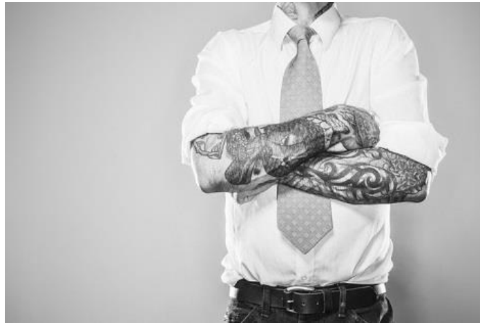
Figure 3: Photo of a man's torso. He crosses his heavily tattooed arms, wearing a business shirt and tie with the sleeves rolled up and the shirt poorly tucked in.