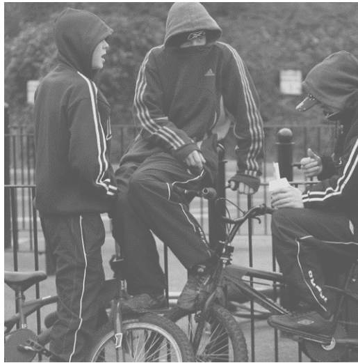
Figure 2: Photo of three young people with bicycles and wearing tracksuits, hoods obscuring their faces.