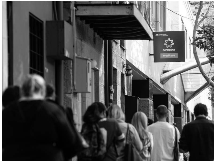
Figure 7: Photo of young people walking towards a Centrelink and Medicare service centre.