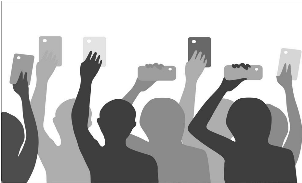
Figure 6: Illustration of seven (7) people holding smartphones in the air.