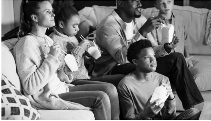
Figure 8: Photo of a family of five (5) eating takeaway food on and near their couch while watching television together.